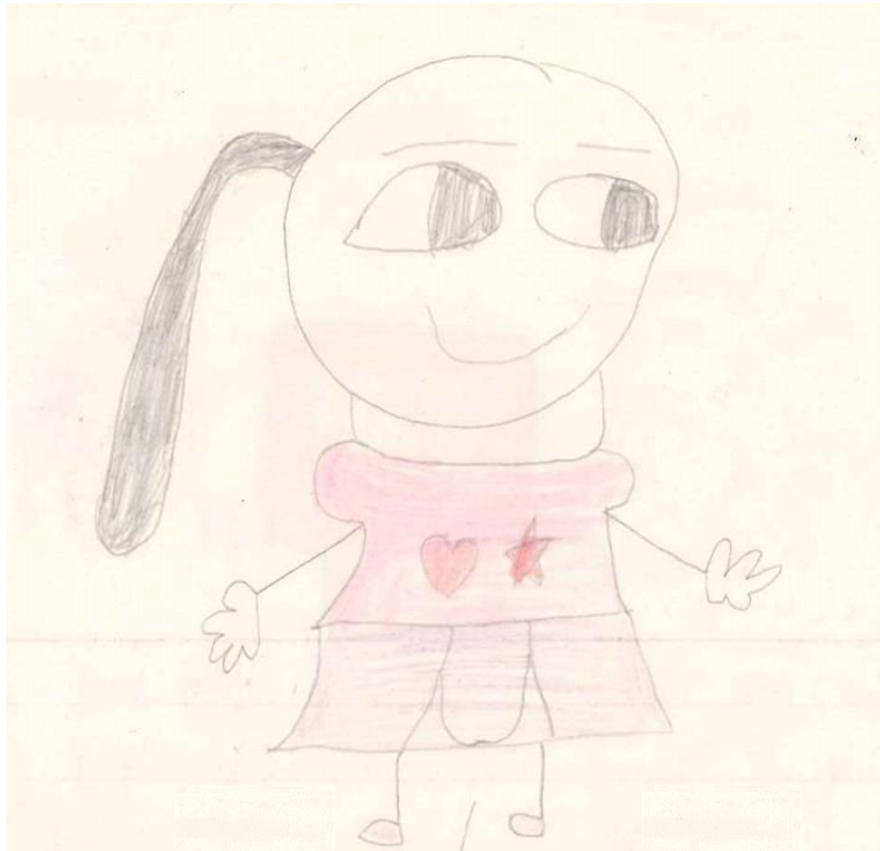
Candy's Photo Album By 2C Xu Huihui, Candy